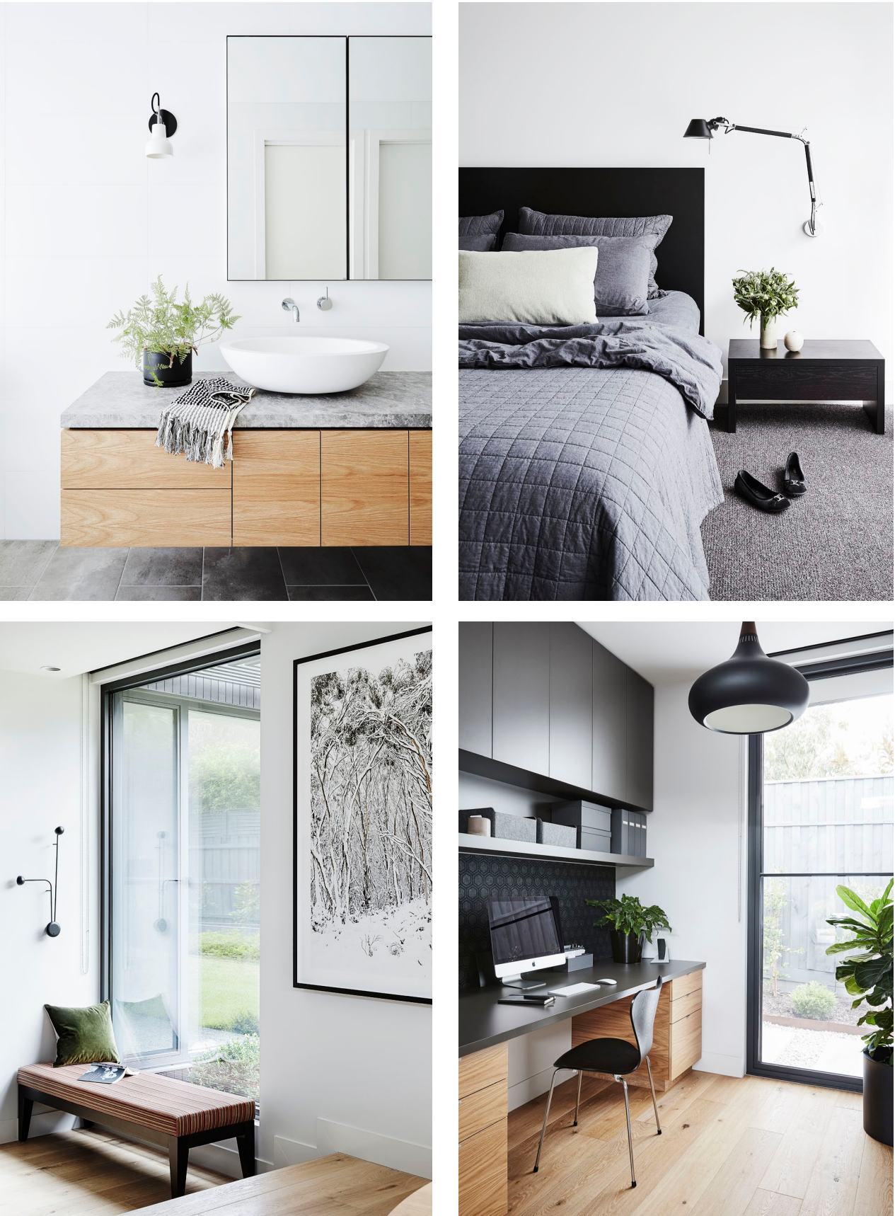
ENSUITE The beauty of natural stone – in this case the richly veined Grey Aether marble that tops the vanity – and the Apaiser 'Sanctum' stone basin add further five-star appeal to this ensuite (top left & opposite). On the floor, 'Glade Cinza' matte tiles from G-Lux offer beauty in simplicity. MAIN BEDROOM Put simply, this space (top right) is "the perfect sanctuary", says Melinda. Tolomeo wall lamps by Artemide are as functional as they are stylish, while the Zuster 'April' bed has been dressed in Sheridan 'Reilly' linen in Carbon. Amping up the room's comfort factor is the wool loop pile carpet in Granite from Chaparral Carpets. HALLWAY "This sunny little spot [above left] was a bit of a surprise – like a gift with purchase!" says Melinda, who found the ottoman a few years ago at Grazia & Co. For the wall above, she chose the limited-edition 'Winter Wandering' photographic work by Katie Carmichael. STUDY Practicality reigns in the home office (above right), where a curvy 'Orient' pendant by Jo Hammerborg from Cult makes a statement. Added touches of black are delivered in the Laminex Fossil workspace and the 'Series 7' chair by Arne Jacobsen. >