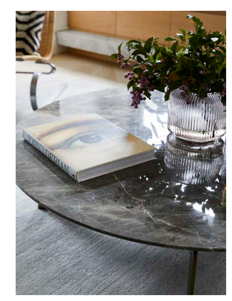
A shapely Marmoset Found vase atop a marble coffee table by Poliform.