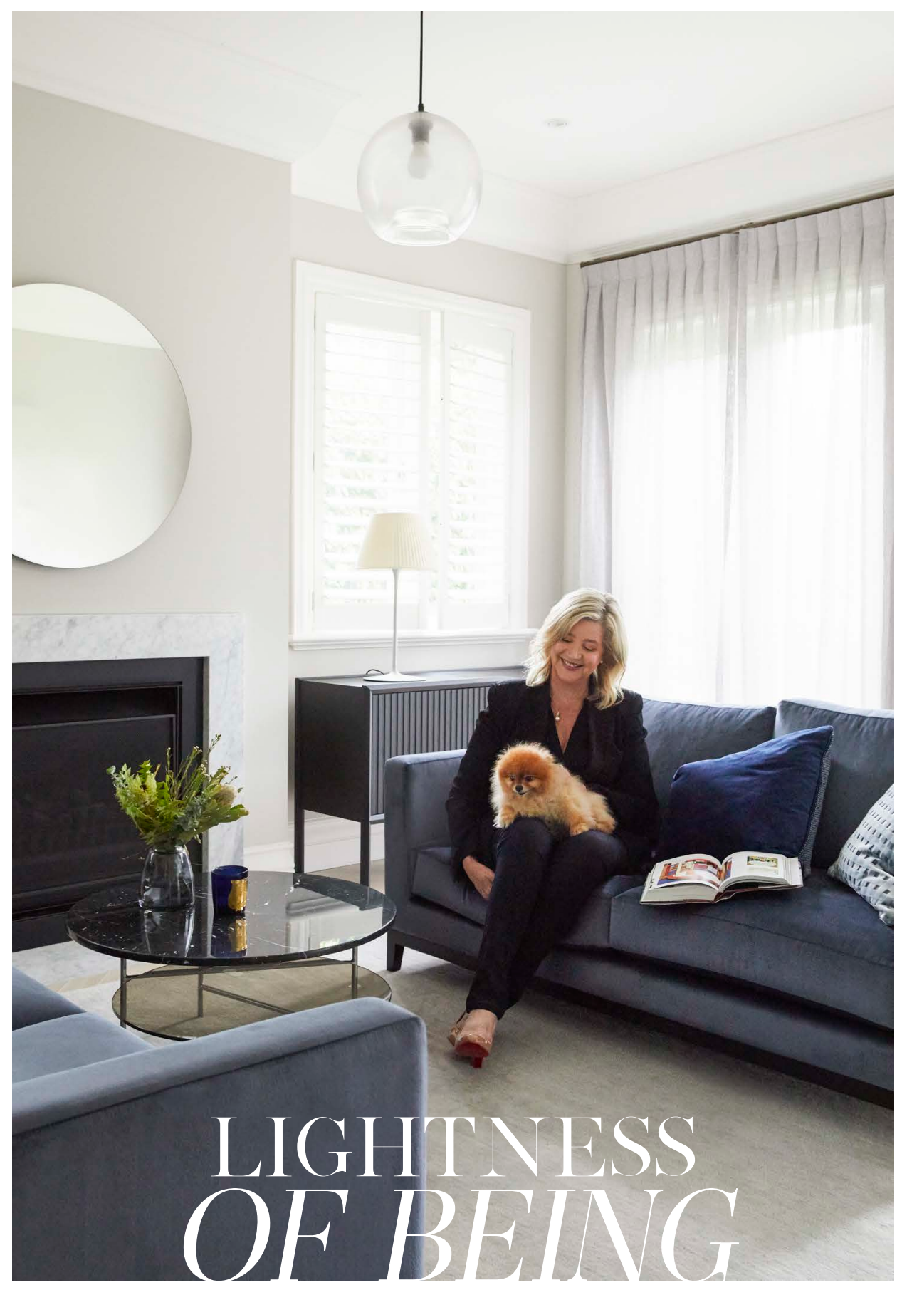
DESIGNED FOR RELAXING AND ENTERTAINING, THIS METICULOUSLY REMODELLED MELBOURNE HOME IS A LESSON IN QUIET LUXURY Story JACKIE BRYGEL Styling JULIA GREEN